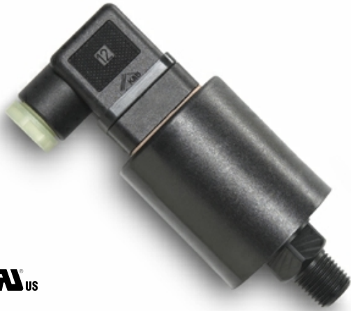
Shown with Complete DIN – Electrical Option HR